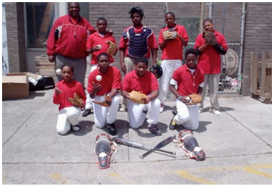
New season in New Orleans